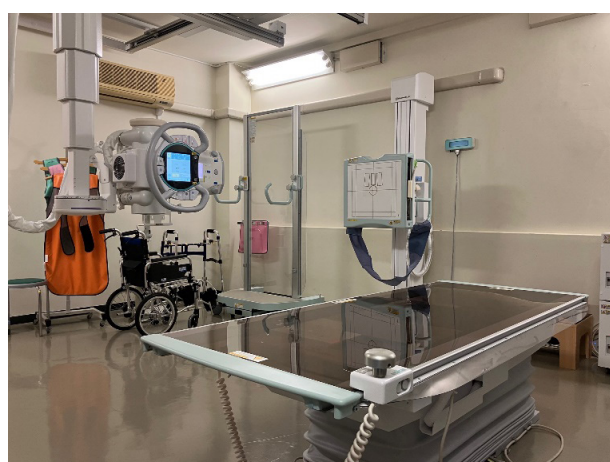
Fig.2 System appearance

The updated radiography room, one of four in the main building primarily used for chest and abdominal imaging, previously had separate X-ray tubes for standing and supine positions. In selecting equipment, emphasis was placed on throughput and operability for chest and abdominal imaging. The newly introduced RADspeed Pro with POWER GLIDE ( Fig.2 ) has a single X-ray tube, but the