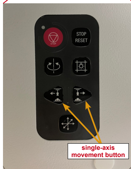
Fig.5 Rear switch (top) and single-axis movement button (bottom)