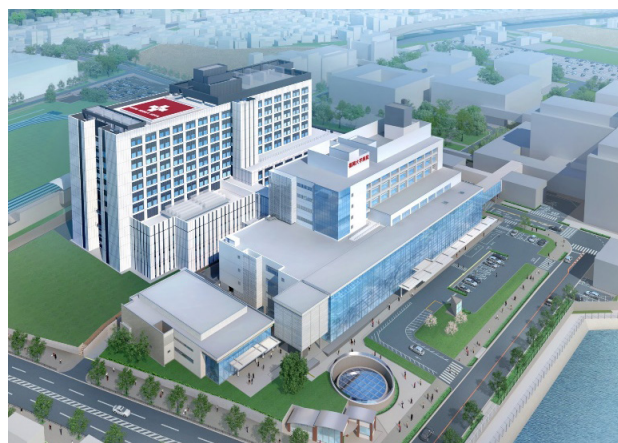
Fig.1 Anticipated completion of the new wing (top) and new main building (provisional name) of Fukuoka University Hospital

December 2023, a new main building is expected to be completed, enhancing the medical services we offer.