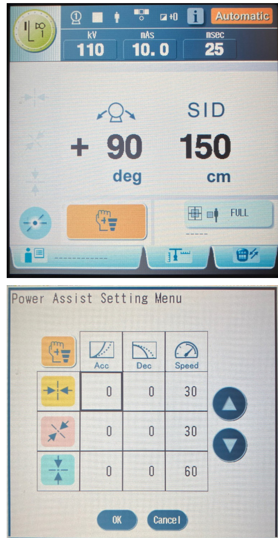
Fig.3 POWER GLIDE assist level adjustment screen (top) and customization screen (bottom)

features for acceleration, deceleration, and maximum speed for each movement axis, allowing users to adjust the feel of use according to each facility's examination types and room sizes (Fig.3).