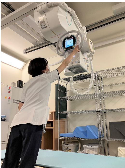
Fig.4 Operation at the retracted position

pull down the tube from its retracted position with minimal effort (Fig.4). Their feedback confirms significant reduction in physical strain, indicating the high assistive performance of POWER GLIDE.