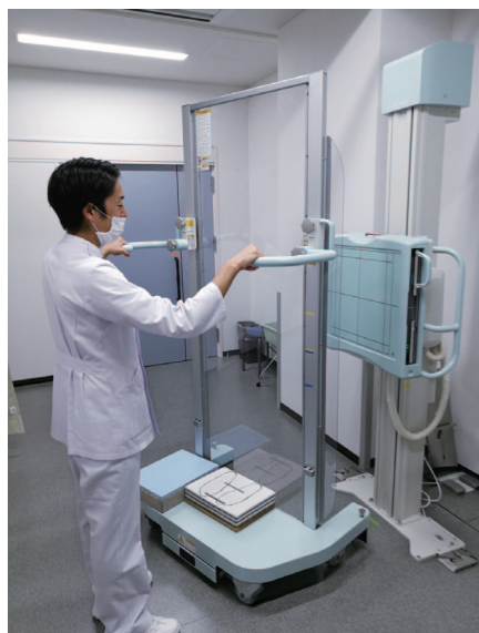
Fig.8 Fender Wall for Long View Radiography

After the new system was introduced, the fender wall for long view radiography looked very substantial, but was actually surprisingly light and moved smoothly, so it did not cause any problems in terms of taking up space in the radiography room (Fig. 8). When placed in front of the Bucky stand, the fender wall can be fixed with two pin halls to prevent it moving when the patient steps up or down from it. If either pin is not engaged, a warning is displayed on the LCD panel attached to the X-ray tube support and radiography is disabled. Using a system designed with such consideration for patient and technologist safety is very reassuring. Large grip bars are provided on both