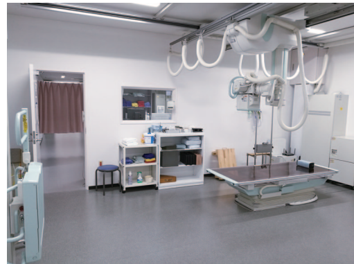
Fig.4 Layout of General Radiography Room 2

First, at the construction design stage, we decided to include three general radiography rooms, all capable of general radiography in standing and supine positions. The radiography room interiors were designed with enough space for flow line of the patient and technologist, for acquiring images either in a wheelchair or on the bed, and so on. Since the general radiography systems would be used by all department personnel, the selection process was discussed many times. Based on experience using X-ray generators, an overwhelming majority recommended Shimadzu general radiography systems, due to easy operability and attention to detail. Other key reasons given included useful functionality, such as interlocking functions around the components, long view radiography, and auto-positioning, and the sincere and prompt services they provide. In terms of image processing, reasons included our expertise using Fujifilm's CR system, which was the first system to successfully offer digital X-ray imaging, extensive image processing technology, such as grid line elimination, multi-frequency processing, and noise suppression, the light weight design, with a 2.6 kg (at the time) 14 × 17-inch size FPD, while also providing a 310 kg load capacity. Consequently, we decided to introduce Shimadzu RADspeed Pro EDGE package which is