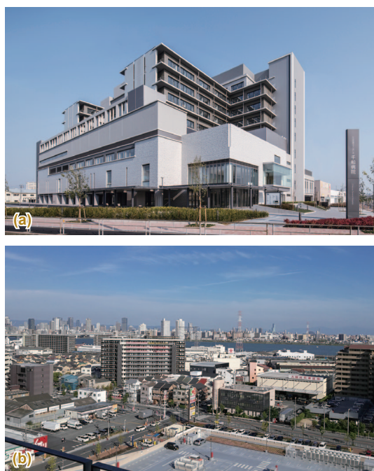
Fig.1 Exterior (a) of and View (b) from the Hospital

The recent update involved replacing almost all of our diagnostic imaging systems. As part of that process, we introduced three new Shimadzu X-ray systems, including the RADspeed Pro EDGE package. The follow is a report of our experience with starting up the systems, starting clinical operations, and using tomosynthesis.