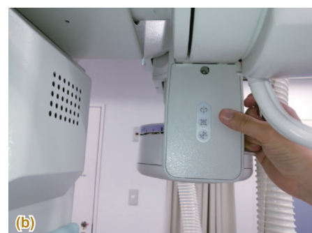
Fig.7 (a) X-Ray Tube Support (b) Bottom of Support Column