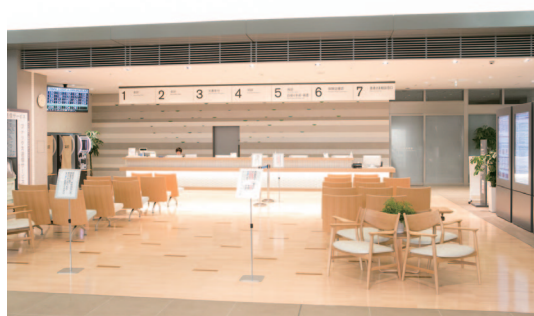
Fig.2 Hospital Front Desk