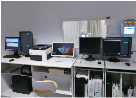
Fig.5 Control Room (Right to left: UD150B-40, the image processing unit, the tomosynthesis image processing unit, the electronic medical record terminal, and the image inspection system terminal)

the technologist to focus on assisting and positioning the patient, which, needless to say, significantly reduced the number of mistakes made selecting the Anatomical Program and X-ray exposure conditions. However, in order to cooperate the entire process, from RIS terminal to image processing unit, an electronic medical records and RIS master database needed to be prepared before the system was introduced. That required specifying radiography parameters for the examination protocol for each target region, and required interlocking the RIS, image processing unit, and X-ray high voltage generator and verifying the link. Therefore, I want to express my gratitude to the technologists that entered and checked all those settings and say how happy everyone in the department is with how much easier the environment is to work in now.