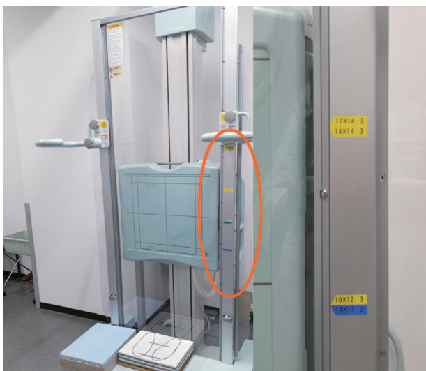
Fig.10 Markers for Long View Radiography