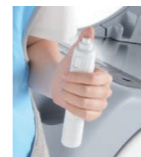
Wireless hand switch

A wireless hand switch or IR remote controller allows you to perform exposures remotely for even more easier usability.