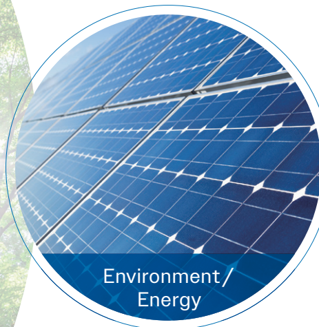
Environment / Energy