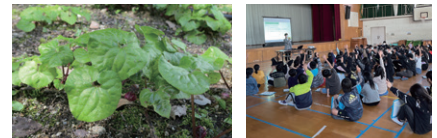
Futaba Aoi plants in the Shimadzu Forest

We will deploy a wide range of biodiversity conservation activities, including forestation activities, and organize environmental education classes at schools in cooperation with local communities, educational institutes, and other groups.