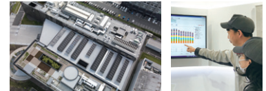
Using renewable energy

In addition to actively introducing renewable energy sources, such as solar power generation and installing smart meters to improve energy efficiency by making energy consumption visible, we will focus efforts on reducing the environmental impact of our entire supply chain.