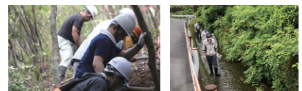
Shimadzu volunteers participating in forestry activities

All employees are actively committed to a variety of environmental initiatives as members of Shimadzu, an environmentally friendly company.