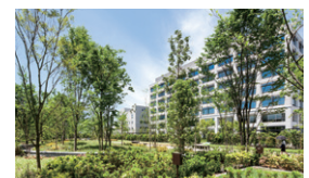
Shimadzu Forest at the Head Office/Sanjo Works

The Japan Habitat Evaluation Program provides an objective assessment of biodiversity conservation or biodiversity restoration measures and is accredited by the Ecosystem Conservation Society - Japan. The Shimadzu Forest at Sanjo Works was the first site in Kyoto Prefecture to earn the highest AAA rating.